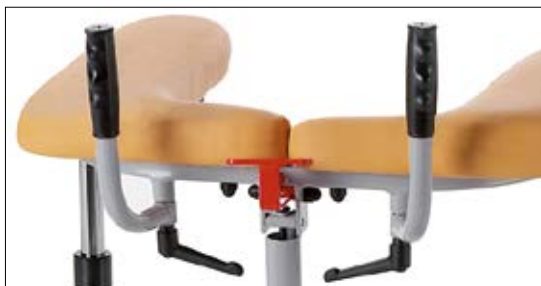
Adjustable handles detail.

Painted steel walker with four swivel castors, two of which are braking, and two adjustable handles. Height adjustable armrests using a gas piston operated by a lever control. This adjustment system allows simply and immediately adapting the aid to the build of the person.