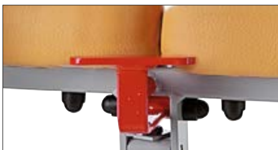
Height adjustment lever control system.