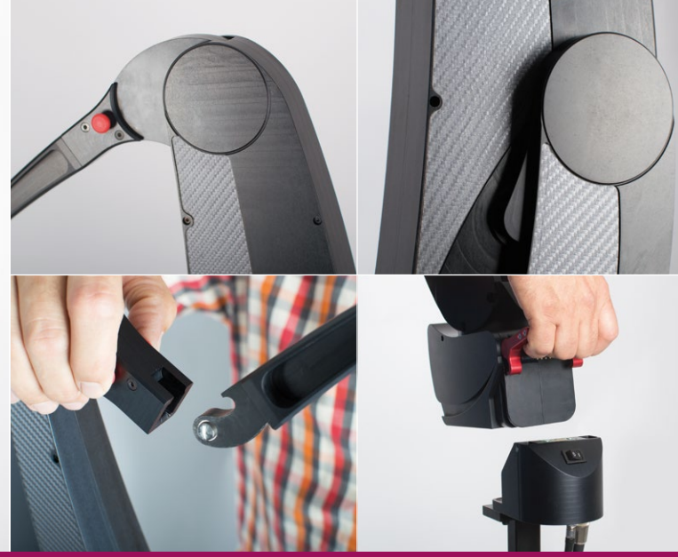
• Gowing can be taken off partly as well as in total

movements the human arm in the horizontal plane. For the performance of important vertical movements e.g. towards the mouth or head virtual pivoting points were introduced. This allows for the quick and easy performance of such frequently performed movements.