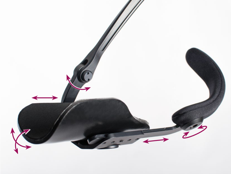
• The arm fitting offers many adjustment possiblities and follows the arm very naturally in any direction