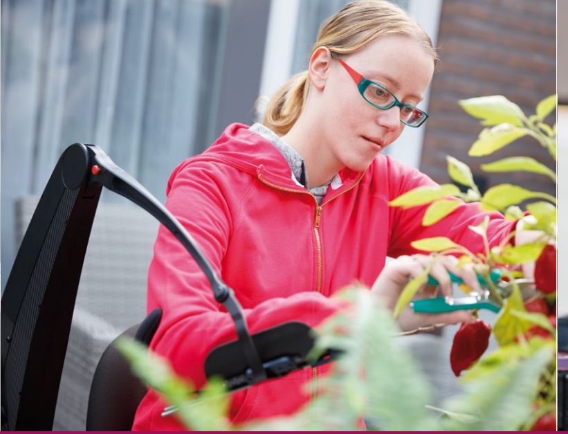
• Gowing can be used both indoors and outdoors