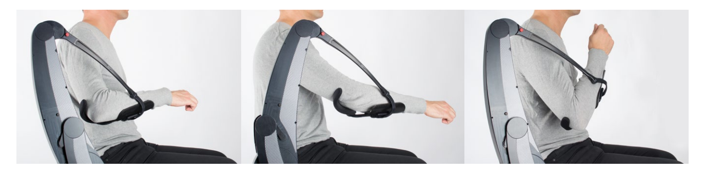
• Large horizontal movements, combined with easy and quick reach of the mouth and face

The intended users of the dynamic arm support Gowing are: Persons challenged by considerable muscular weakness causing the inability to perform essential ADL activities including eating, drinking, facial care, computer use, labour tasks, wheelchair control. Persons challenged by excessive muscle functioning who feel the need to execute such essential manual tasks.