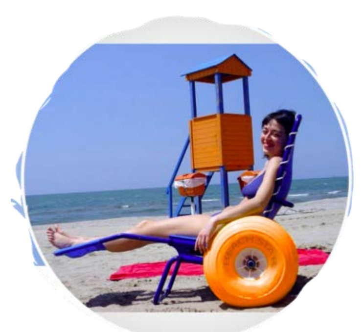
poelietilen explosion-proof wheel

NART ACCESS Disabled and Elder Lifts Company Address: Güzelyurt Quarter 5742 street No: 51 / A Manisa -TURKEY